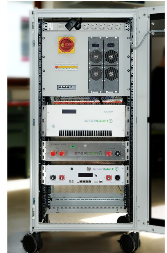
Foto: Test setup